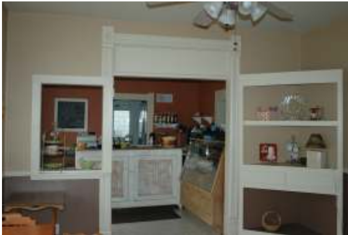
Check out area with plenty of display area and casework