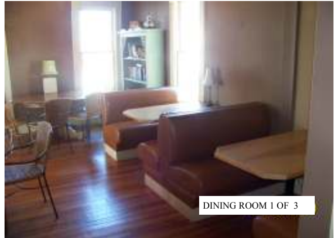
DINING ROOM 1 OF 3